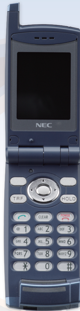
UNIVERGE Terminal MH250

For more information, visit necunified.com/wlan .